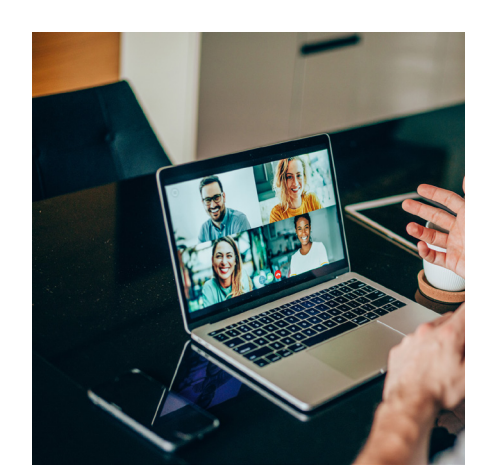
Digital transformation of work Accelerated by the pandemic

Arthur D. Little has been at the forefront of innovation since 1886. We are an acknowledged thought leader in linking strategy, innovation and transformation in technology-intensive and converging industries. We navigate our clients through changing business ecosystems to uncover new growth opportunities. We enable our clients to build innovation capabilities and transform their organizations.