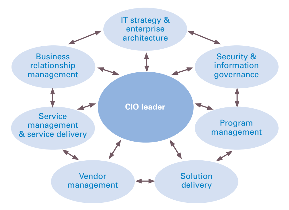
Figure 1: The seven voices of technology

technology can be implemented without necessary controls being in place. Documenting these tensions and rebalancing the "voices", alongside establishing a set of leading, rather than lagging, KRIs, will begin to drive a cultural and mind-set shift within the organization. This addresses an issue often missed by traditional approaches.